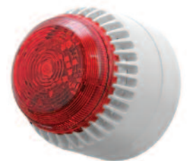
RoLP Solista White